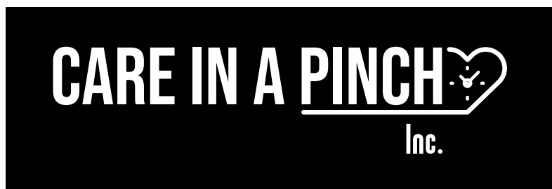
ONE COLOUR REVERSE